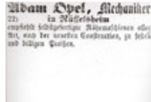
On April 10, 1863, Adam Opel advertises his sewing machines for the first time, in the Groß-Gerauer Kreisblatt.