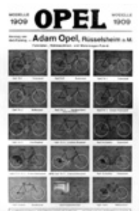
Excerpt from a bicycle catalog, 1909.