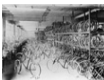
Bicycle production, 1912