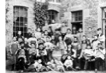
Group photograph of the sewing-machine assembly workers, 1875

1872 Adam Opel establishes a factory health insurance plan.