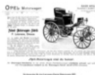
Advertisement for the Opel Patent Motor Car, 1899.