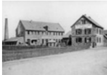
The first factory building, 1868