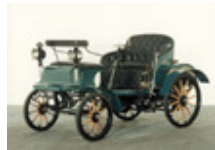
The first Opel: the Patent Motor Car, System Lutzmann, 1899.