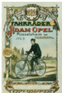
Cover of a bicycle brochure from the period.

1886 By entering the booming business of bicycle manufacture, Opel secures a second foothold for his company. The Opel sons are enthusiastic cyclists, winning several hundred races on Opel bicycles in the years up to 1898. In less than forty years, Opel becomes the world's largest bicycle producer.