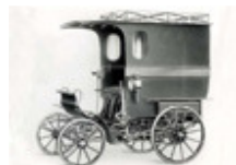
Opel's first utility vehicle, based on the Patent Motor Car. Popularly known as the "Koloss von Rüsselsheim" (Giant of Rüsselsheim).