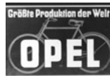
Opel manufactures bicycles for five decades (1886–1937), becoming the world's largest bicycle producer in the 1920s.