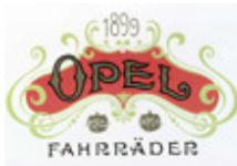
Bicycle advertisement in the art nouveau style of the period, 1899.

1899“Opel Patent Motor Car, System Lutzmann” is the name given to the first Opel automobile. It marks the beginning of production in Rüsselsheim, and forms the basis for building the first utility vehicles. Within the year, the company makes its international motor sport début.