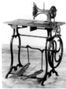
The first Opel sewing machine, 1862.